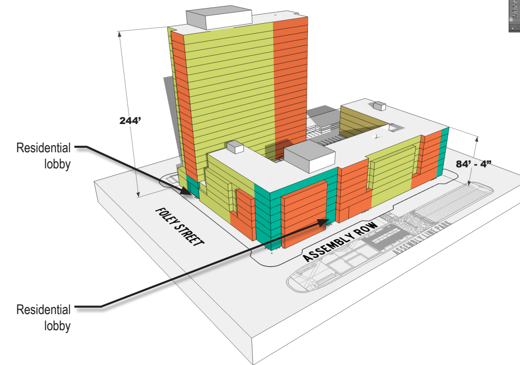
1. View of N-W corner

Note: Exact location is subject to change based on further building design